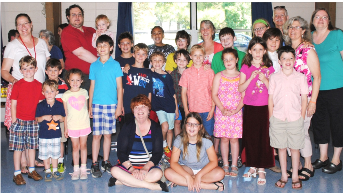
Sunday School students and teachers gathered for an End of School Year Party (more photos pg. 6)